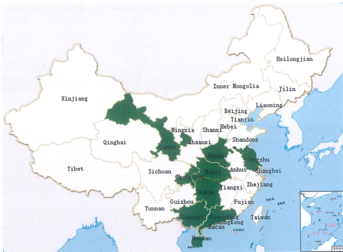
Figure 1: Geographical Distribution of Allocated Green Projects

ADBC plans to use proceeds while following the GBP. Funded projects are classified into three categories: sustainable water and wastewater management, environmentally sustainable management of living natural resources and land use, and renewable energy.